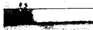
On the Trail of the Berlin Wall Page 88–117