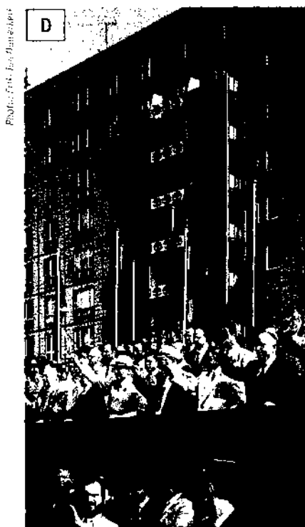
On the Trail of Plattenbau Page 118–183