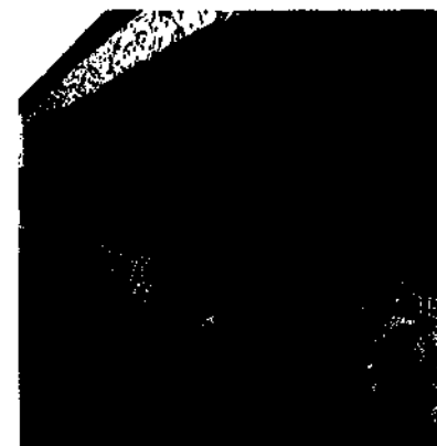
Tour C: Two hours by bicycle