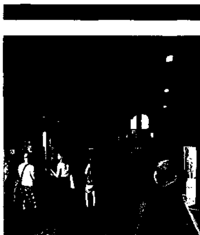
Tour B: Two hours by foot