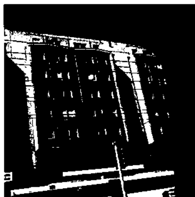
Tour D: Three hours by car