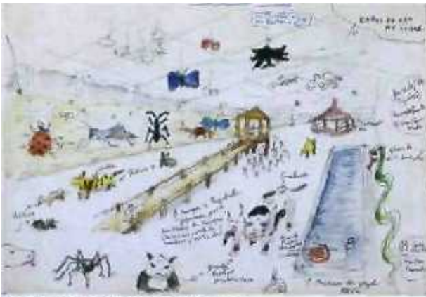
INTERVAL FOR CHILDREN 159

THh PUI'UiAR ^MDTRF RBJGIOUS IN UNA HO ArLhiLL-Liufil di-^vicPJanrt Unking elfCienis 161